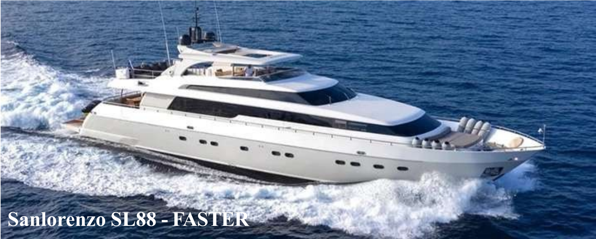
Sanlorenzo SL88 - FASTER