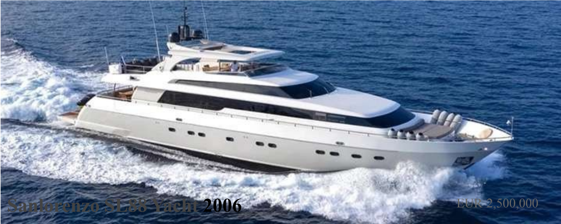
Sanlorenzo SL88 Yacht 2006